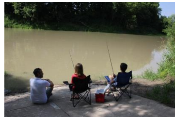
FISH AND CAMP AT BIG BEND CONSERVATION AREA (WARDSVILLE)