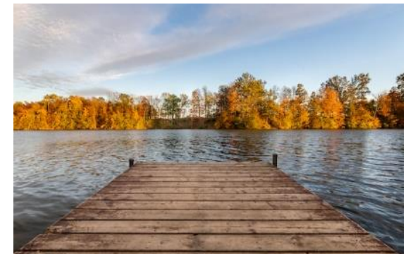
ENJOY THE TRANQUILITY AT SHARON CREEK CONSERVATION AREA (DELAWARE)