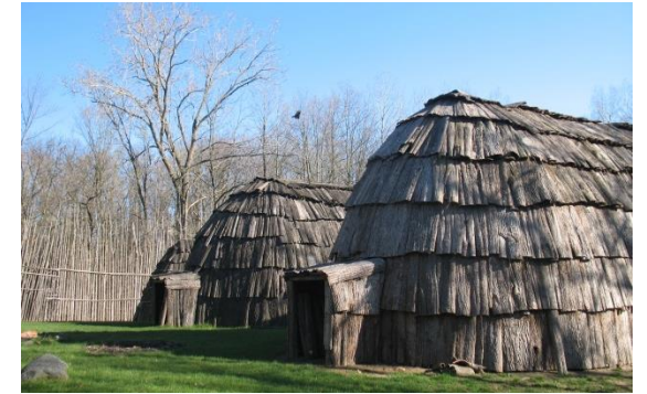
VISIT SKA-NAH-DOHT VILLAGE AND MUSEUM AT LONGWOODS ROAD CONSERVATION AREA (DELAWARE/MOUNT BRYDGES)