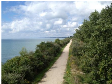
WALK THE SHORELINE AT MCGEACHY POND CONSERVATION AREA (ERIEAU)

The Lower Thames Valley Conservation Authority has 18 public conservation areas. Group and/or family camp, hike or spend the day at a picnic area, visit a cultural site or enjoy one of the many environmentally significant natural areas of our watershed! Check out our website www.ltvca.ca for details of locations.