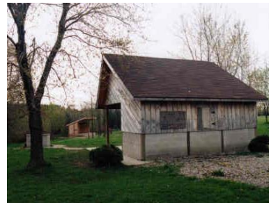
HIKE AT TWO CREEKS CONSERVATION AREA (WHEATLEY)