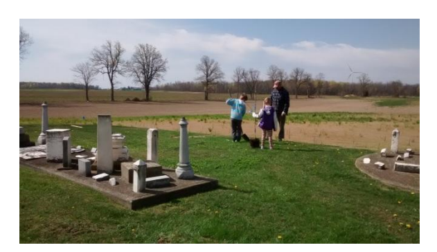
Shewburg Cemetery community tree planting event

CK Public Health ~ Sponsor what is known as "Your Roots Are Always in CK". This partnership aims to retain youth or influence them to come back to CK after post-secondary. The CK Public Health also has an interest in skin cancer prevention through shading school yards and communities with trees.