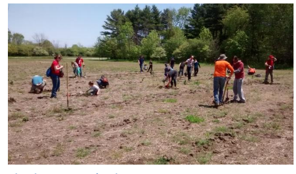
Riparian Ranger planting

Media Events ~ several articles were written about various stewardship activities over the course of spring and summer ensuring our message is fresh with our audience. Our 3 tours were well covered as well.