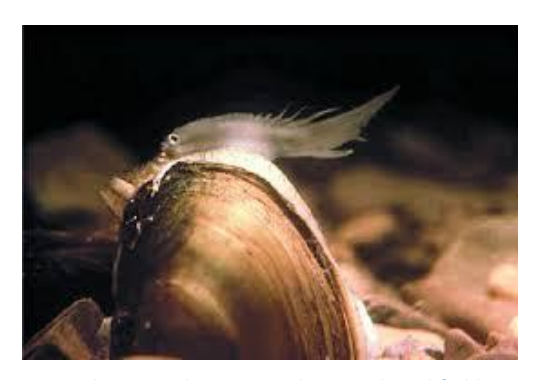
Lampsilis Mussel attracting bass with its life like lure

The Lower Thames Valley is also hiring a Species at Risk Aquatic Biologist to develop an aquatic Species at Risk (SAR) program for the Lower Thames watershed and implement a SAR Sec.11 agreement with DFO. This position will develop, coordinate and implement all field sampling, laboratory analysis, data management and summary reporting for the LTVCA's aquatic monitoring program (including benthic invertebrate, fish and mussel habitat monitoring).