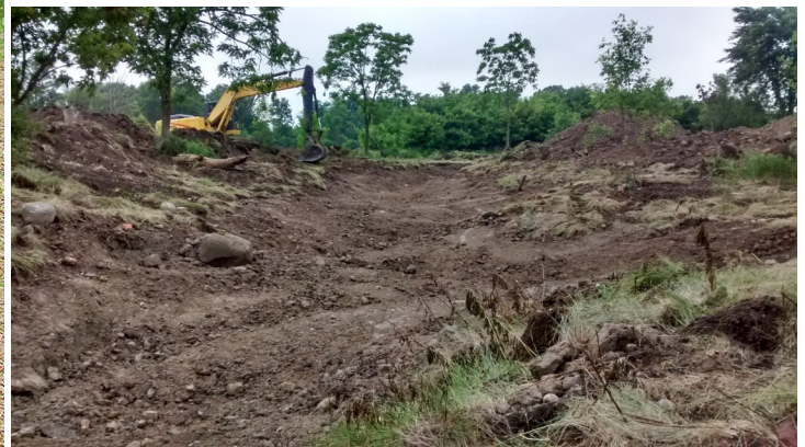
Gutoski wetland being excavated

With the end of tree planting season and dry weather, wetland excavations have resumed with additional funding acquired from Wildlife Habitat Canada $30,000.