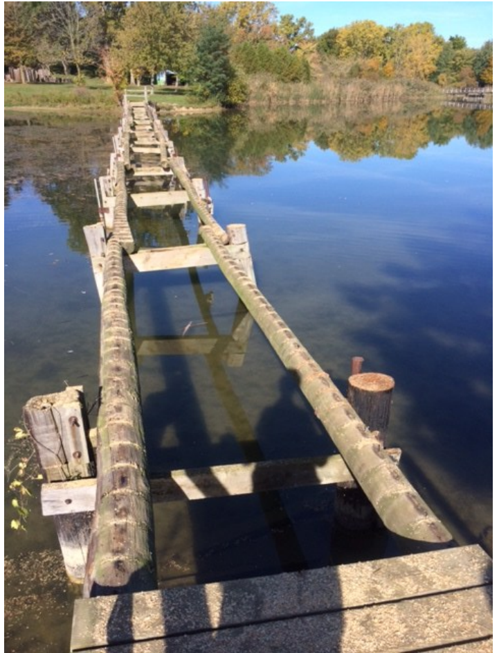
C.M. Wilson bridge in the process of being removed for earthen structure which is low maintenance and less liability.

The C.M. Wilson Fish Habitat Improvement Project was approved by the MNRF's Land Stewardship & Habitat Restoration Program for $19,000 to complete wetland improvements.