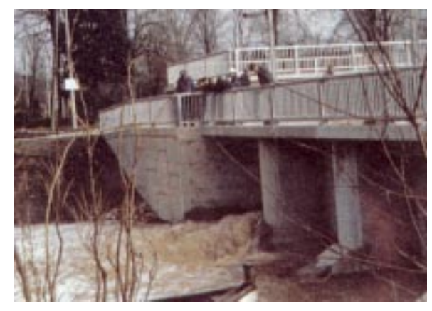
Dam and pumping station Indian/McGregor Creek Flood Control Project

Overthe years, the LTVCA has developed a comprehensive flood forecasting and warning system. We have good communications with the Upper Thames River Conservation Authority as well as with the Aviation, Flood and Fire Management Branch of the Ministry of Natural Resources. The LTVCA has installed a system of water level monitoring stations on the Thames River and the Indian/McGregor Creek systems. These stations are used to determine the reaction of the stream to aclimactic event and ascertain the impact these stream flows have on flood prone areas. The LTVCA has also developed a high degree of expertise in monitoring and evaluating the effect of weather conditions and river flows on ice jams in the lower part of the river. Quick response times to member municipalities of weather warnings or watches are a priority.