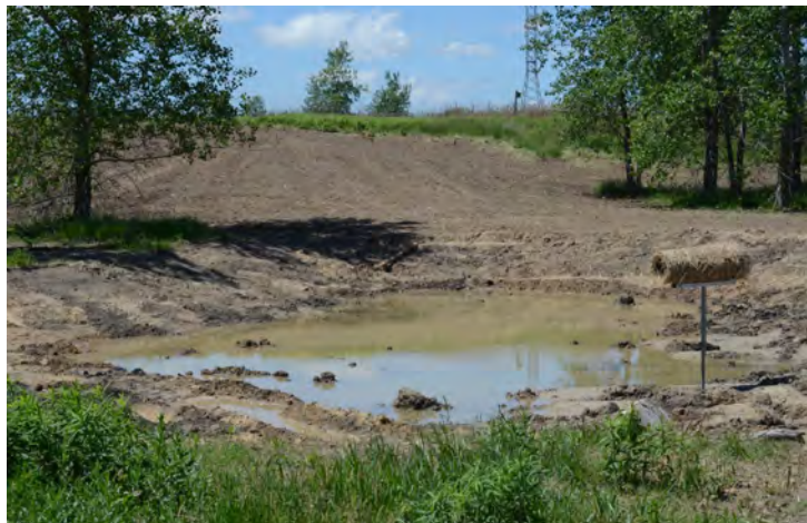
Recent wetlands completed at the Thames River Diversion Channel on Creek Rd.

ZUBLER-Rudy Zubler is a dairy farmer in East Kent and respects nature. He recently purchased 50 acres, of which, 15 acres was marginal, low, and originally a wetland. Rudy decided to restore it to its original state. Two ponds were created in the lowest areas. Within the ponds are turtle hibernation structures. The surrounding berms were planted with a selection of wildlife shrubs