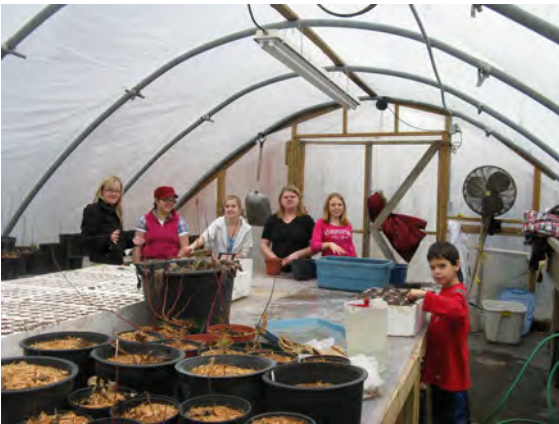
Volunteers planting tree seeds at the Greening Partnership Greenhouse

This program is gaining momentum with the addition of Union Gas as a partner. The list of partners is growing to include The