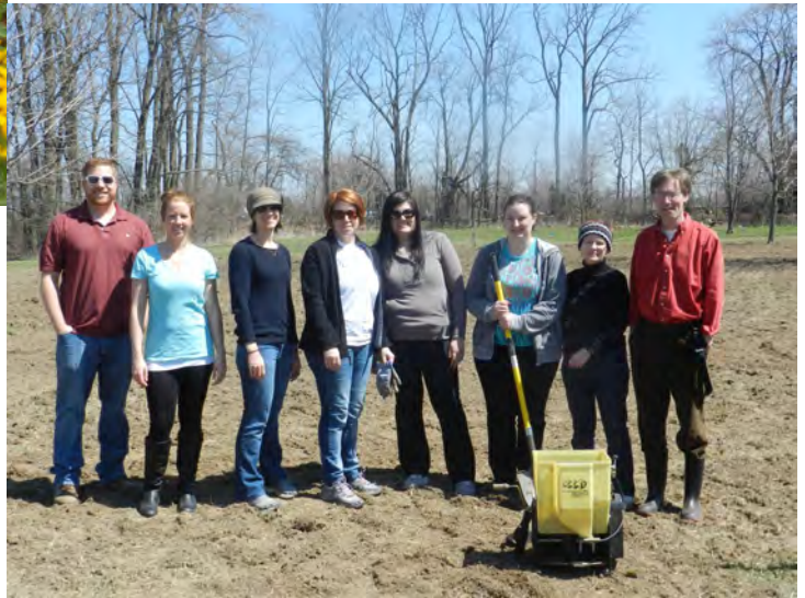
Thames Grove tall grass prairie restoration planted by Scribendi (above).

ROL-LAND FARMS-The local mushroom farm is involved with the Greening Partnership to mitigate phosphorous run off in the Rondeau Bay. 1000 meters of tall grass prairie buffers are being installed along with a series of catchment ponds. Overall project costs were approximately $30 000.