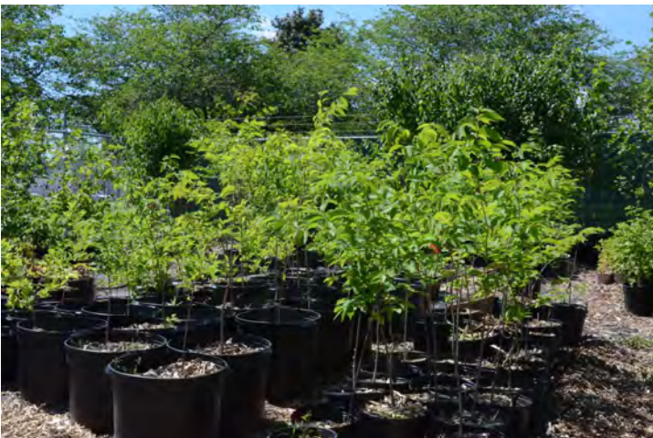
Greening Partnership large stock trees at the CK Horticulture facility on Grand Avenue

Over the past seven years we have raised over $1.2 million, planted approximately 470,000 tree seedlings, restored nearly 400 acres/160 hectares, and planted over 8000 large stock trees in public parks throughout Chatham-Kent.