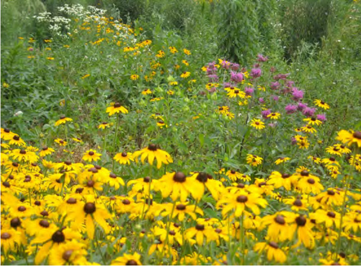
Tall grass prairie restoration in full bloom

ROL-LAND FARMS-The local mushroom farm is involved with the Greening Partnership to mitigate phosphorous run off in the Rondeau Bay. 1000 meters of tall grass prairie buffers are being installed along with a series of catchment ponds. Overall project costs were approximately $30 000.