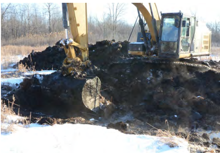
Excavations being completed at the Zubler wetland restoration project on Kenesserie Rd. East Kent.

This year we had several wetland restorations resulting from partnerships with Ducks Unlimited, Species at Risk Farm Incentive Program, Stewardship Kent, and rural landowners. The total area of wetland restoration was 13 acres/5.3 hectares.