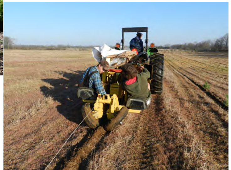
Landowner receives Greening Partnership Award for 19 000 seedlings planted near Thamesville

During the spring of 2013 we have planted approximately 65 000 trees with the help of land-owners, community groups, and local schools.