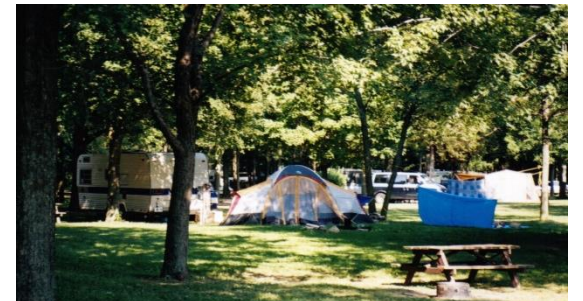
CAMP AT C.M. WILSON CONSERVATION AREA (CHATAM)