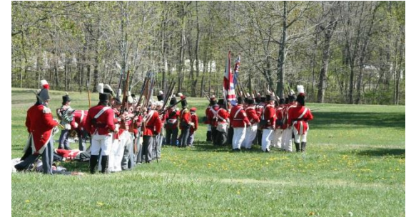
ENJOY LONGWOODS HERITAGE WEEKEND AT LONGWOODS ROAD CONSERVATION AREA (DELAWARE/MOUNT BRYDGES)