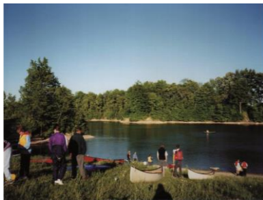
PADDLE AT SHARON CREEK CONSERVATION AREA (DELAWARE)