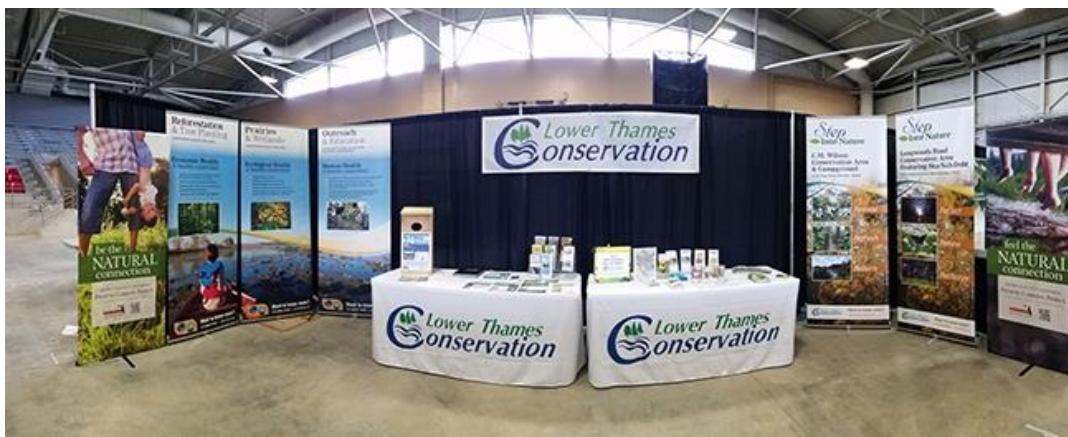
Our display at the Grow Wild Grow Wild Expo – April 2, 2016

When staff attend these events, we post on Facebook and Twitter to get our messages out.