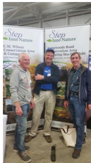
The booth was always busy at Go Wild Grow Wild Expo with lots of networking with other organizations!