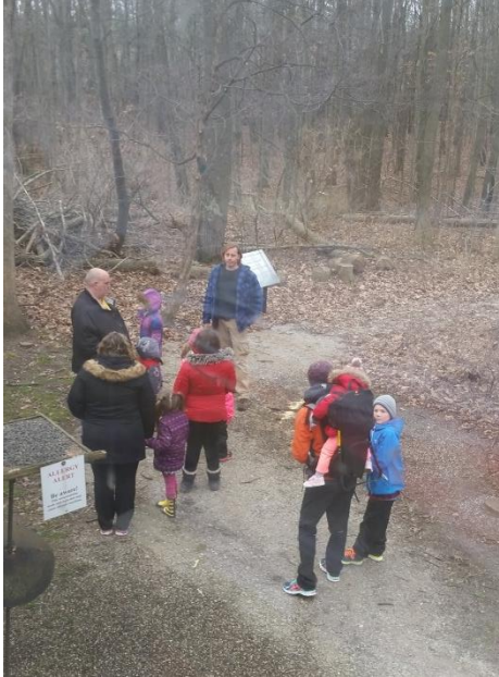
Nature hikes and tours of Ska-Nah-Doht Village were offered at Longwoods over the March Break week.

This year Longwoods and Ska-Nah-Doht offered a March Break Program – guided nature hikes and tours of the Village at 10 a.m. and 1 p.m. daily. People signed the guest book from Chatham, Camlachie, Markham, London and 1 from Stoke England. Gift shop sales were busy. 98 people participated in the planned activities.