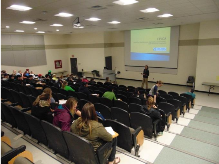
Presentations on Pollinators, The Greening Partnership and Phosphorus captured the attention of students at Ridgetown College. All presentations have been posted on our website for public viewing.

The goal of this program is to enhance public awareness of how Best Management Practices (BMP's) can promote profitability and production for agricultural landowners while reducing the phosphorus load in Lake St. Clair and Lake Erie. Staff have researched and designed 3 brochures (available at meeting) to highlight awareness about phosphorus, soil conservation and pollinators. A presentation was given to over 70 students at the University of Guelph Ridgetown Campus on March 17 th comprised of 3 PowerPoint presentations.