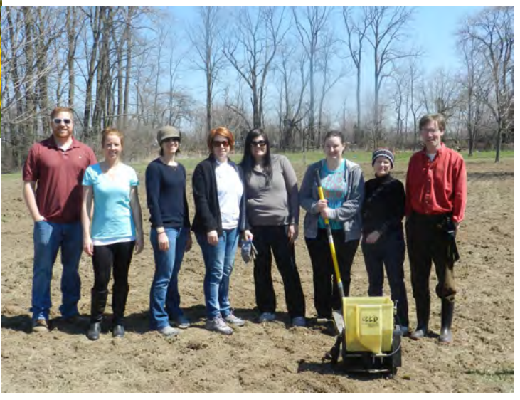
Thames Grove tall grass prairie restoration planted by Scribendi (above).

Parry Landing Prairie on the Thames River (below)