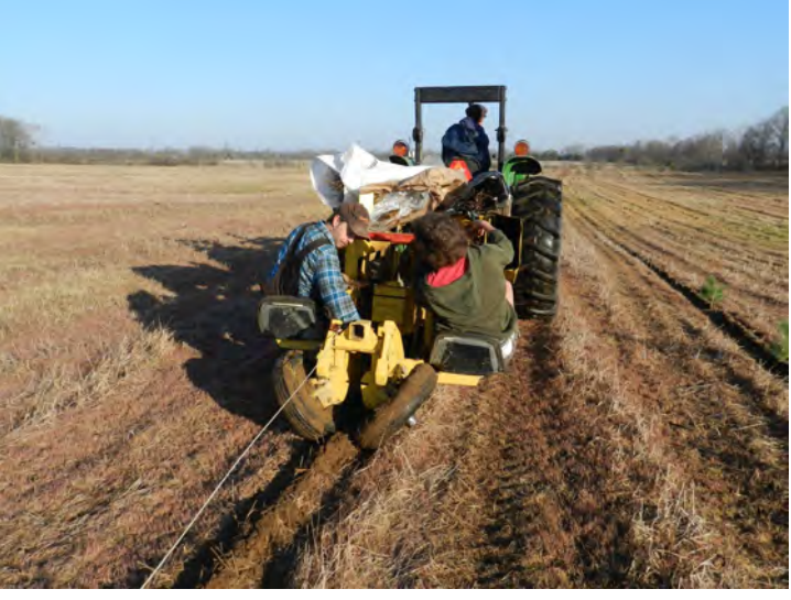
seedlings planted near Thamesville

During the spring of 2013 we have planted approximately 65 000 trees with the help of landowners, community groups, and local schools.