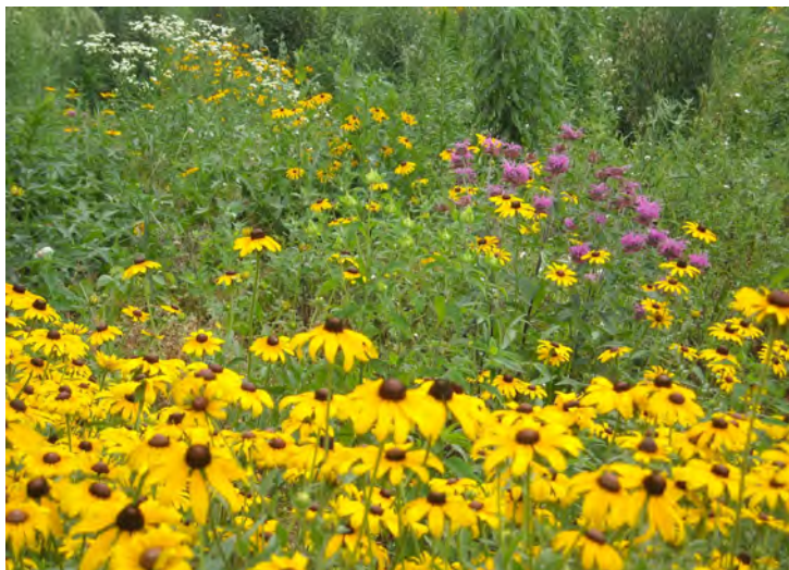
Tall grass prairie restoration in full bloom

ROL-LAND FARMS-The local mushroom farm is involved with the Greening Partnership to mitigate phosphorous run off in the Rondeau Bay. 1000 meters of tall grass prairie buffers are being installed along with a series of catchment ponds. Overall project costs were approximately $30 000.