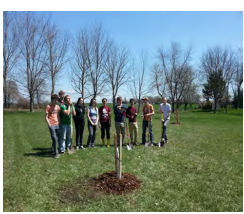
JOHN MCGREGOR S.S. volunteers after a spring planting event

Municipality of Chatham Kent, Stewardship Kent, Union Gas, along with 15 local schools. The students make it happen! Events are generally held at a school greenhouse or our very own Greening Partnership greenhouse.