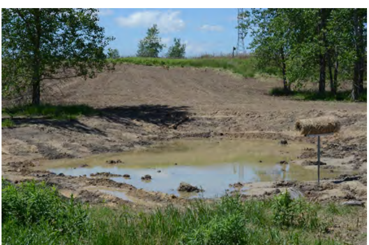
Recent wetlands completed at the Thames River Diversion Channel on Creek Rd.

ZUBLER-Rudy Zubler is a dairy farmer in East Kent and respects nature. He recently purchased 50 acres, of which, 15 acres was marginal, low, and originally a wetland. Rudy decided to restore it to its original state. Two ponds were created in the lowest areas. Within the ponds are turtle hibernation structures. The surrounding berms were planted with a selection of wildlife shrubs