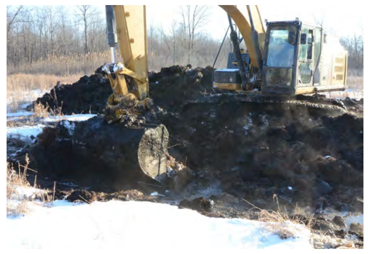
Excavations being completed at the Zubler wetland restoration project on Kenesserie Rd. East Kent.

This year we had several wetland restorations resulting from partnerships with Ducks Unlimited, Species at Risk Farm Incentive Program, Stewardship Kent, and rural landowners. The total area of species of wetland plants were planted with the wetland restoration was 13 acres/5.3 hectares.