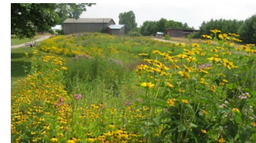
Fanshawe Pioneer Village

The drought and salt-tolerant grasses and flowers provide nectar for insects, seeds for birds and beauty for humans.