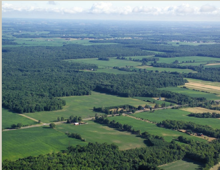
Aerial view Skunk's Misery