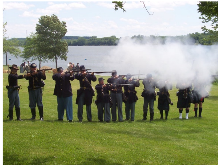
Civil War Reenactment

Parks Canada has initiated a series of events to commemorate the War of 1812 in several regions of southern Ontario. This commemoration will be a great opportunity to share our collaborative heritage and a 200 year legacy of peace between countries.