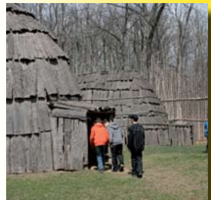
Ska-Nah-Doht Village and Museum is located in Longwoods Road Conservation Area. Curriculum based native studies programs attract thousands of students, teachers and chaperones annually. In the summer months, tourists from around the world explore the longhouses inside the palisade.